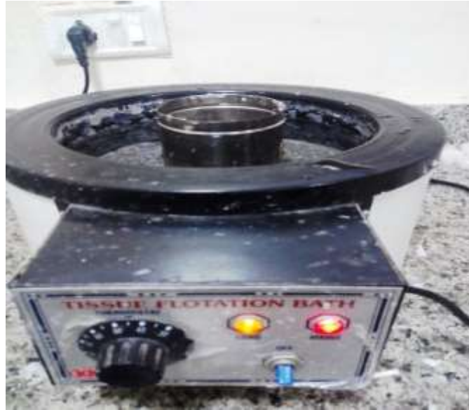
Fig. 1: Showing a common tissue floatation bath showing a metallic container holding the decalcifying fluid