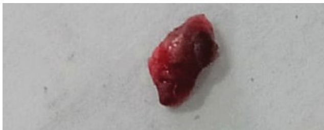
Fig. 1: Nodule removed in-toto (8 mm in size)

On physical examination, a solitary lesion of about 3 × 3 × 1 cm involving the scrotum was noticed. The skin surrounding the nodules, testis, and penis was normal on palpation. The swelling was painless and firm inconsistently. On laboratory examinations, the following were found to be within normal limits: serum calcium, phosphorus, parathyroid hormone, and vitamin D hormone levels; uric acid; alkaline phosphatase; and lipid profile. Based on clinical features and physical examination, a diagnosis of sebaceous cyst of the scrotum was made. The swelling was excised under local anesthesia. His postoperative period was unremarkable and no evidence of recurrence during a six-month follow-up period. The cut section of nodular swelling showed solid white to bluish homogenous areas. Histopathological examination shows skin tissue lined by keratinized stratified squamous epithelium. The underlying dermis had granules and globules of basophilic calcified material along with foreign body giant cell reaction to calcium showing numerous histiocytes and multinucleated giant cell areas of fibrosis and calcification (Figure 3 a,b)