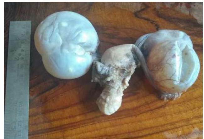
Fig. 5: Gross examination: Hysterectomy specimen showing bilateral cystic adnexal mass with smooth outer surface

study group had a mean age of 36 years and the maximum number of malignant cases were seen above 40 years of age.