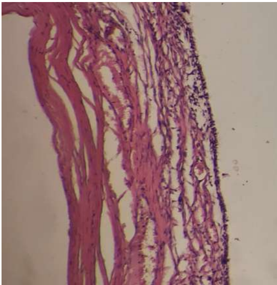
Fig. 2: M/E 400 x view Single layer of bland looking epithelial cells lining the cyst wall of Serous cyst adenoma