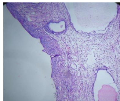
Fig. 1: Atrophic endometrium(H&E x 10x)

endometrium, vulva, vagina and hysterectomy specimens. Benign conditions were 51.6%, malignant 39.07% and premalignant 9.27%. (Table 5) Benign conditions included cervicitis, cervical polyp, atrophic endometrium, proliferative endometrium without atypia, endometrial polyp, endometritis, adenomyosis, leiomyoma and prolapse. It was noted that atrophic endometrium (Fig. 1) was the most common histological lesion in benign conditions that is 19 cases (11.7%), followed by proliferative endometrium 15 cases (9.2%). (Table 6) But atrophy was found to be 49.9% by Gredmark et al, 16 52% by Lee WH et al, 12 16.3% by Naik et al, 11 32% by Cheema et al. 2 The probable explanation for unexplained bleeding from atrophic endometrium are fluctuation of serum levels of estrogen, nonspecific chronic endometritis, sclerotic degeneration of myometrial arterioles, associated diabetes mellitus & hypertension, uterus prolapse causing passive congestion& bleeding, rupture of endometrial cysts. 29