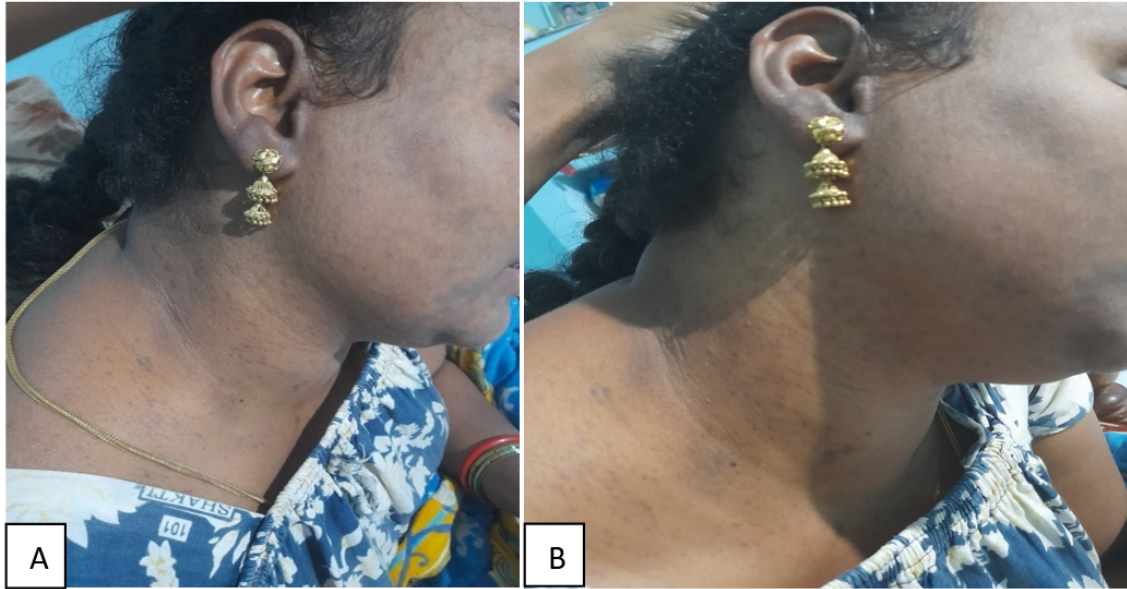
Fig. 1: Clinical Pic of patient (LPP)- Showing ill-deffined, discrete and confluent areas of slate gray pigmentation distributed over face and neck