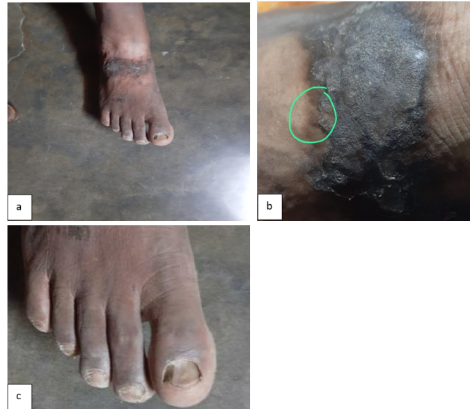
Fig. 1: a,b): Multiple hyperkeratotic, verrucous papules/plaque like lesions on dorsal aspects of hand and feet; c): Thickening of the nail plate with longitudinal ridges seen in the big toe