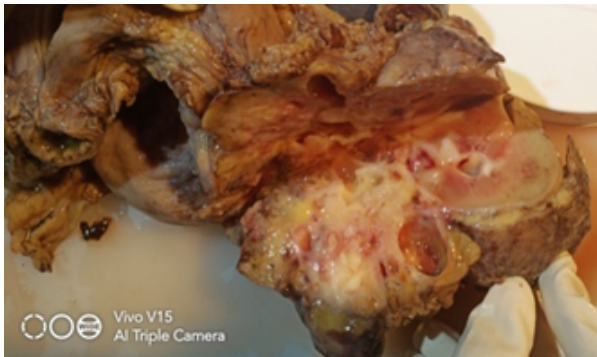
Fig. 1: Gross image: white tan tumour with areas of haemorrhage and necrosis

Multiple sections studied from: Tumour are arranged in interlacing fascicles and bundles of malignant spindle cells with variable cellularity with elongated vesicular nucleus and scant eosinophilic cytoplasm. Marked nuclear atypia. Tumour giant cell noted. 20/10HPF mitosis seen. Large area of necrosis seen. 16 reactive lymph node identified. Inked margin, Perinephric fat, Gerota fascia are free from tumor. Possibility of malignant mesenchymal tumor, undifferentiated renal cell carcinoma are considered. IHC shows SMA, Desmin, Caldesmon positive in spindle cell and CD 34 highlight blood vessel with 25% of Ki-67%. So final diagnosis is renal leiomyosarcoma [p T4 pN0]. Complete resection done and on follow up patient is doing well.