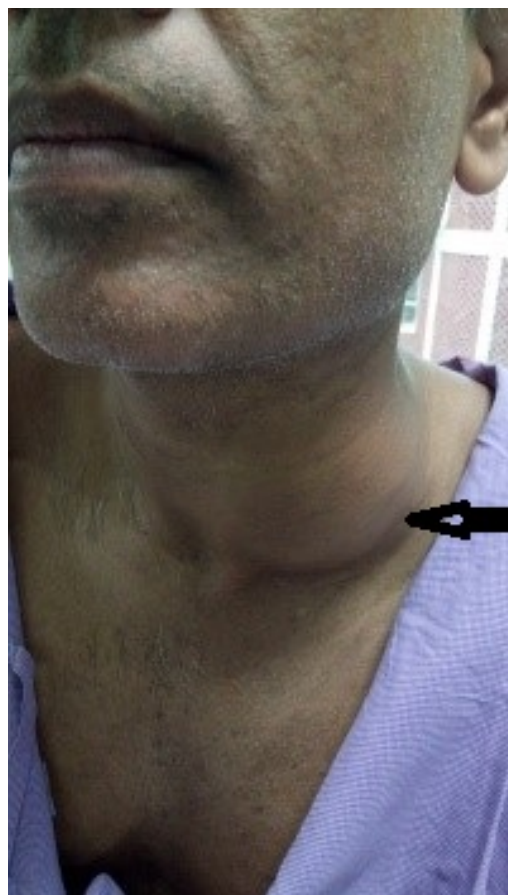
Fig. 1: Clinically picture showing swelling over anterio-lateral aspect of left lower neck region (arrow).

Mostly, Schwannoma presented as slow growing painless swelling in the lateral neck with firm consistency and usually reported between third to sixth decades of life. 1