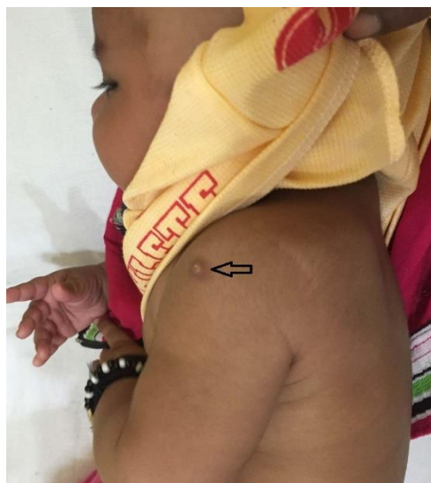
Fig. 1: Clinical photograph of 02 months old male child presenting with swelling and erythema at BCG vaccination site at left arm (Arrow). This patient presented with axillary swelling of 1.5x 1cm, which on FNAC yielded grayish particulate aspirate